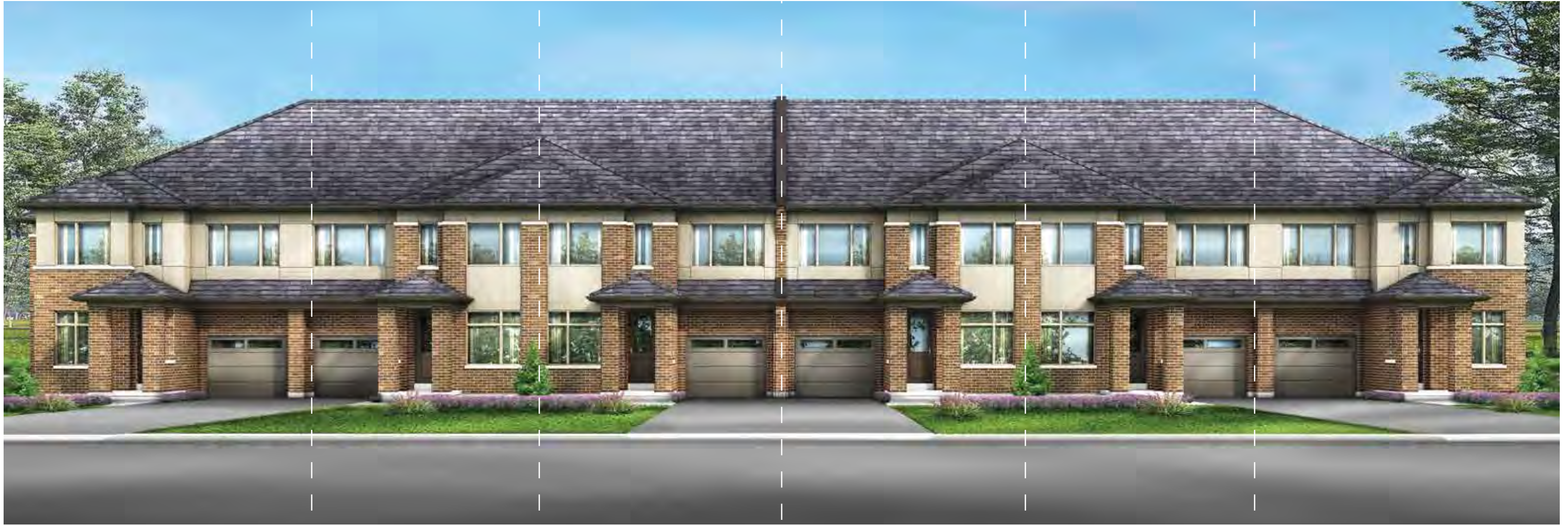
JOHNSTON 25-01 • EL. 'C2' UPGRADE END